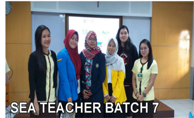
SEA TEACHER BATCH 7