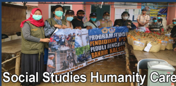
Social Studies Humanity Care